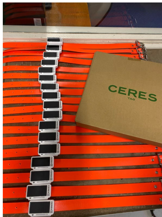
Ceres Tags (Trace) on collars

Actors in the mock trial were divided into three groups: the thieves; the farmer/landholder; and the police. The thieves stole the sheep using a tandem trailer, the farmer monitored Ceres Tag data and alerts in Mapipedia, and the police followed standard protocols to intercept and recover the stolen sheep using the data from the tags. The actors operated in isolation and were unaware of the actions or information of each other. There were only two contact points between the actors: first when the farmer called the police to report the theft of their stock, as indicated by the Mapipedia alerts; and second when the police, acting on this data and information, intercepted the thieves. The roles of the thieves and farmer were occupied by members of the research team, while the role of the police was