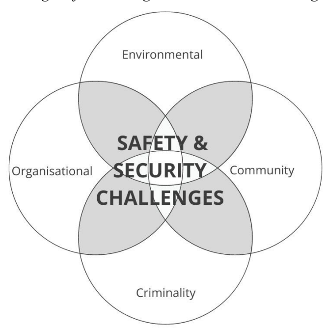
Figure 3 Safety and Security Challenges of Rural, Regional and Remote Policing

While some officers actively choose to work in RRR communities, all are required to do so at some point in their careers, even if these postings are transitory (i.e., the minimum