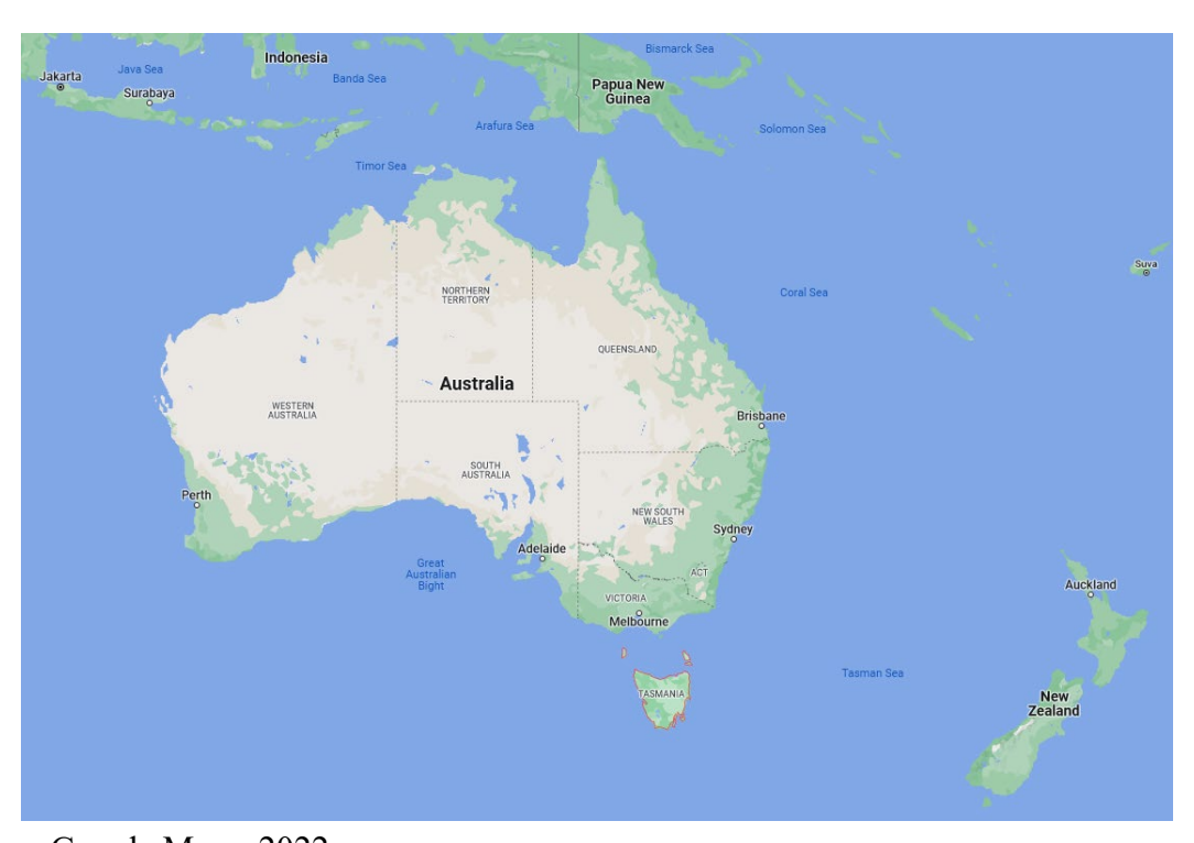
Figure 1 Map of Australia with Tasmania in context

Tasmania, about 250km south of the mainland of Australia (Discover Tasmania, 2022), has an area of 64,519 square kilometres (see Figure 1 for location of Tasmania in context on map of Australia). This increases to 68,401 square kilometres when its islands are added (Geoscience Australia, 2022), three of which are inhabited: Bruny Island; Flinders Island; and King Island. Tasmania is roughly the size of West Virginia in the United States or the Republic of Ireland (refer to Figure 2 for satellite view of Tasmania).